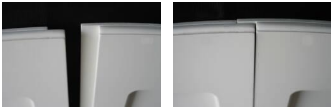
2 Part Non-Movable Assembly