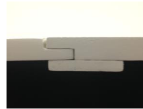
2 Part Movable Assembly